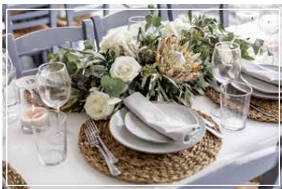
Lily Red Photo